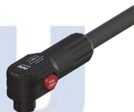
黑色线端 L 母头 E10-FLB