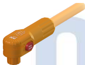
橙色线端 L 母头 E10-FLO