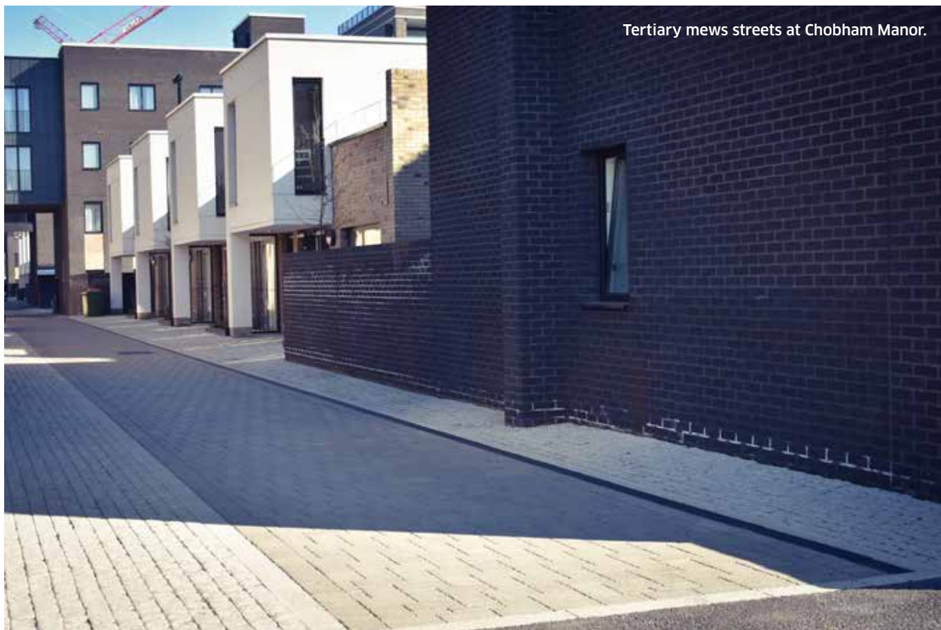
Tertiary mews streets at Chobham Manor.