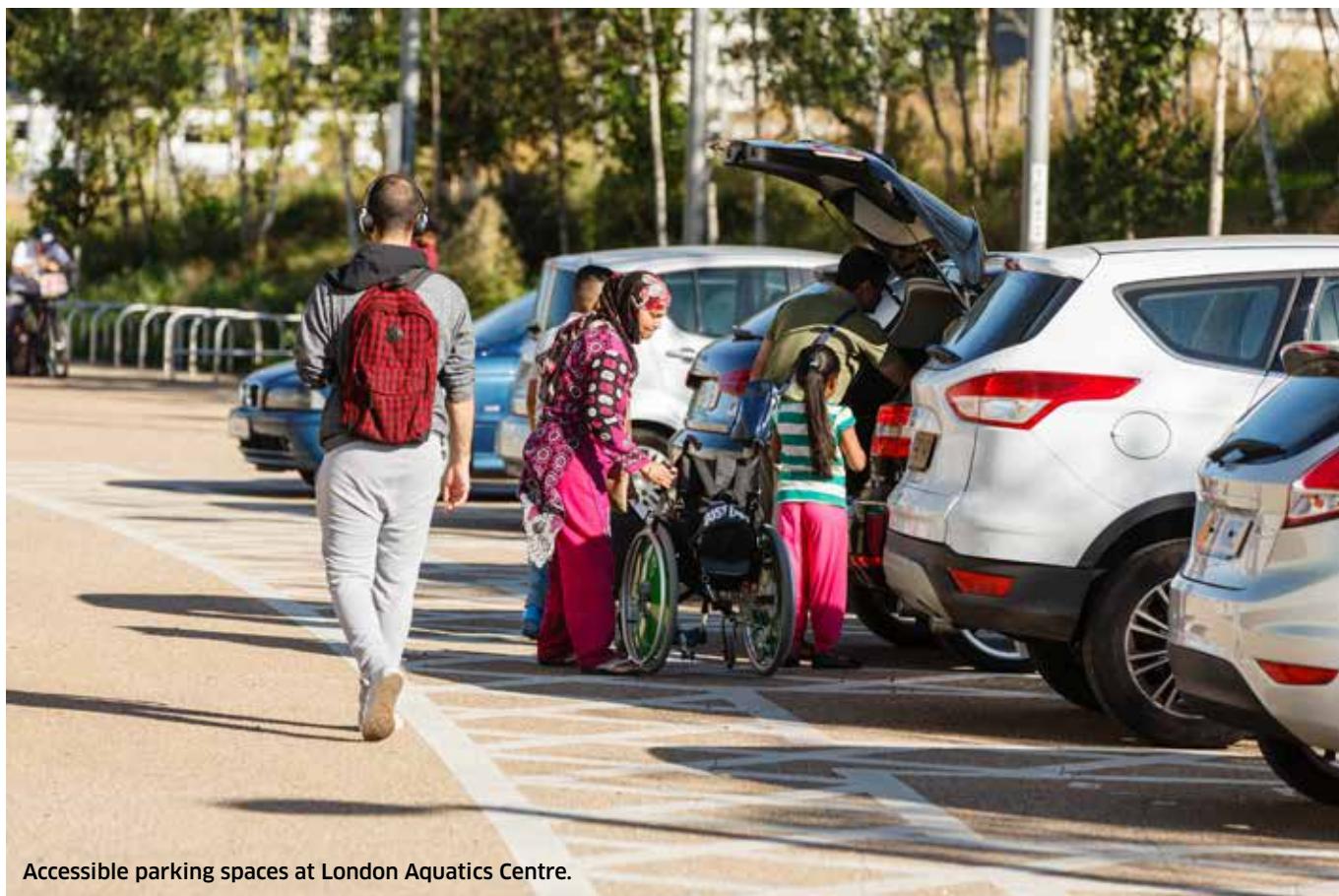
Accessible parking spaces at London Aquatics Centre.