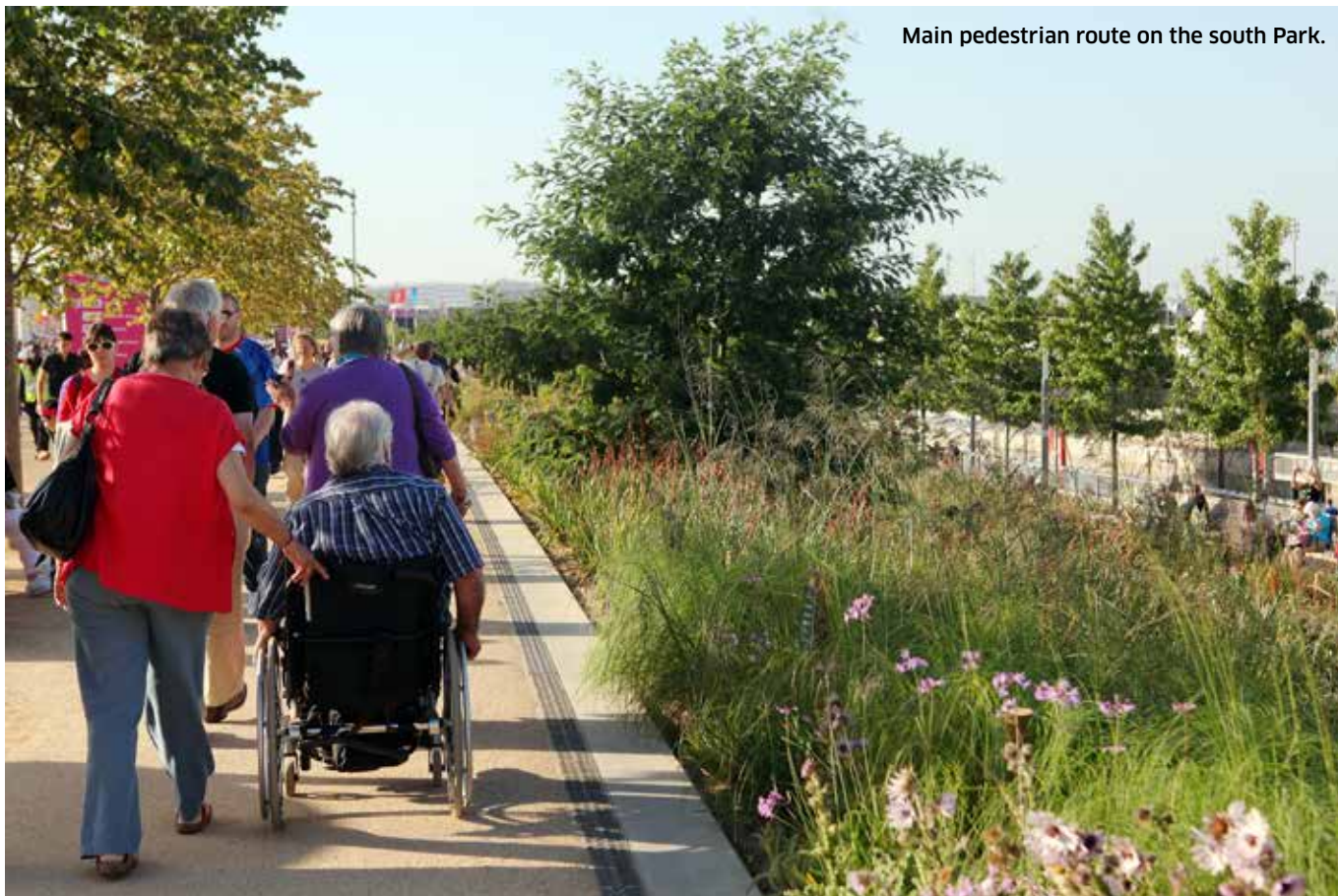
Main pedestrian route on the south Park.