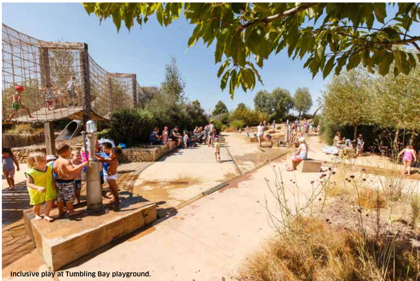
Inclusive play at Tumbling Bay playground.