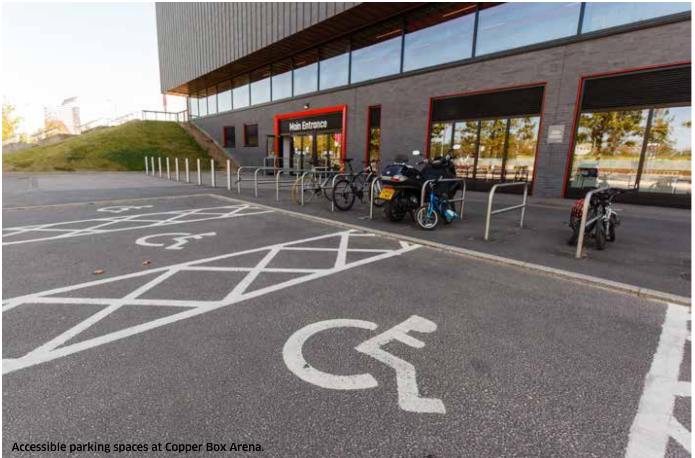
Accessible parking spaces at Copper Box Arena.